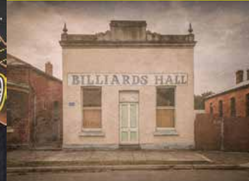
Natalie Ord Chiltern Billiards Hall 2016 digital photo