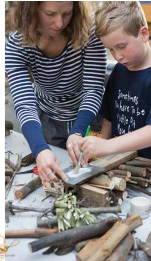
Go Wild in the Garden workshop participants

Is it a bird, is it a plane ? No, it’s two blokes looking for bees. Thanks to Murray Arts for Go Wild in the Garden . We love our new pollinator.