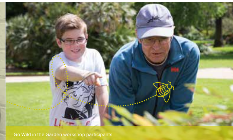
Go Wild in the Garden workshop participants