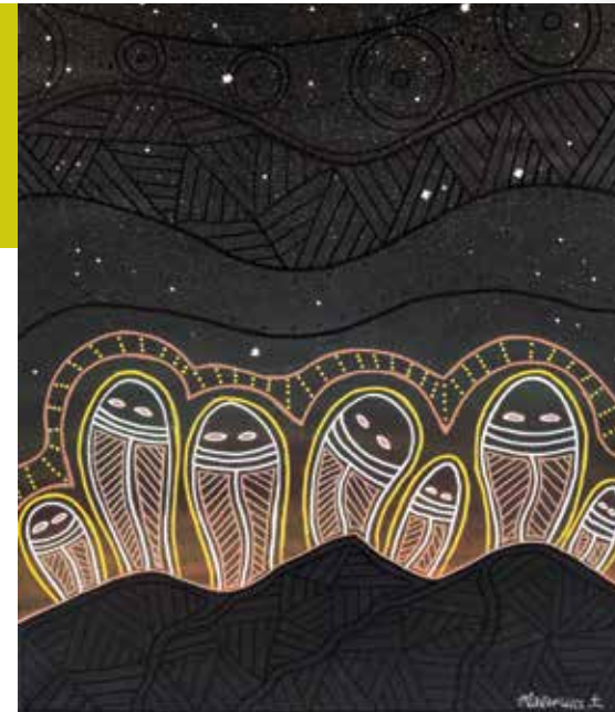
Darren Wighton Gudylin - Ancestral Time , 2015, acrylic on canvas